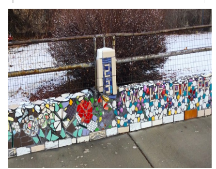
New Public Art