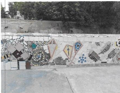
New Public Art